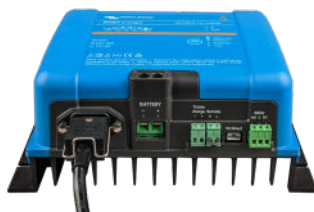
Smart IP43 Charger 12/50(1+1)