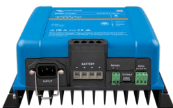
Smart IP43 Charger 12/50(3)