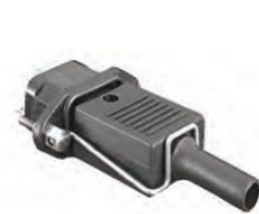
Retainer clip (included)