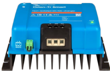
Orion-Tr Smart non-isolated 12/12-30