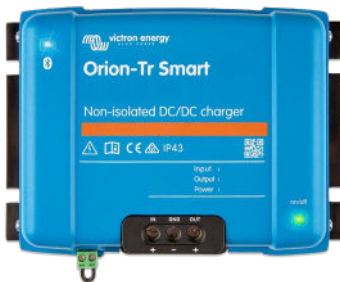
Orion-Tr Smart non-isolated 12/12-30