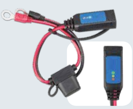
Battery indicator eyelet M8

Carry Case for Blue Smart IP65 Chargers and accessories