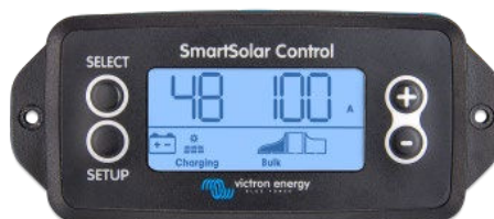
SmartSolar pluggable display

Simply remove the rubber seal that protects the plug on the front of the controller, and plug-in the display.