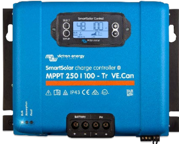
SmartSolar Charge Controller MPPT 250/100-Tr VE.Can with optional pluggable display