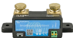
Bluetooth sensing: SmartShunt