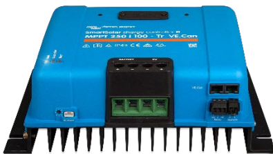
SmartSolar Charge Controller MPPT 250/100-Tr VE.Can without display