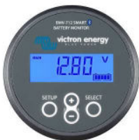
Bluetooth sensing: BMV-712 Smart Battery Monitor