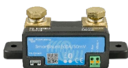
Bluetooth sensing: SmartShunt