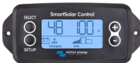
SmartSolar pluggable display

Simply remove the rubber seal that protects the plug on the front of the controller, and plug-in the display.