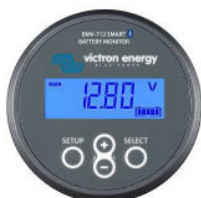
Bluetooth sensing: BMV-712 Smart Battery Monitor