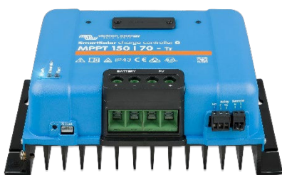
SmartSolar Charge Controller MPPT 150/70-Tr without optional display