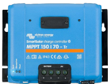
SmartSolar Charge Controller MPPT 150/70-Tr without optional display