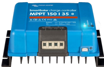
SmartSolar Charge Controller MPPT 150/35