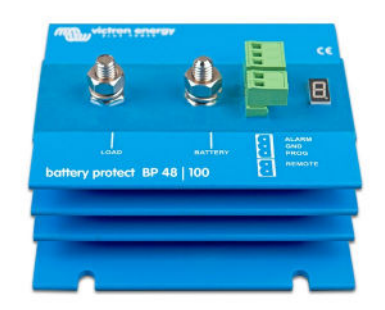
BatteryProtect BP 48-100