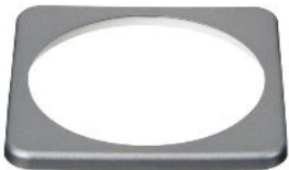
BMV bezel square