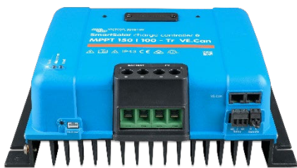
SmartSolar Charge Controller MPPT 150/100-Tr VE.Can without display