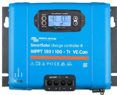
SmartSolar Charge Controller MPPT 150/100-Tr VE.Can with optional pluggable display