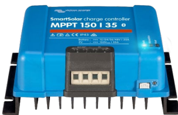
SmartSolar Charge Controller MPPT 150/35