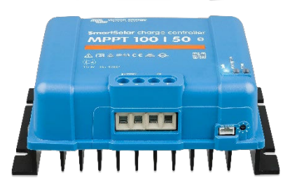
SmartSolar Charge Controller MPPT 100/50