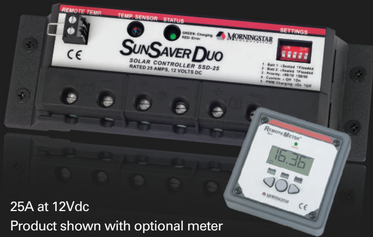
25A at 12Vdc Product shown with optional meter