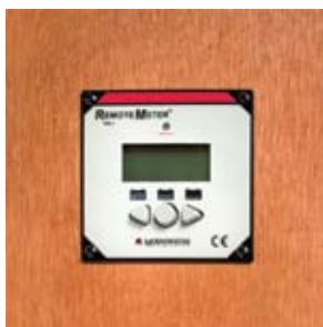
In Wall Mount