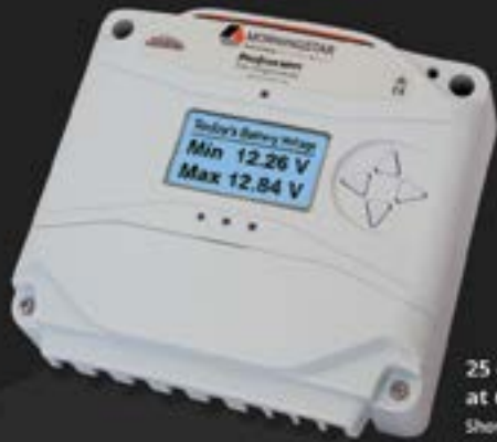
25 or 40 amp versions at up to 120 VOC Shown with optional meter