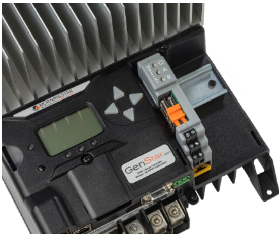
ReadyRelay installed in a GenStar MPPT charger