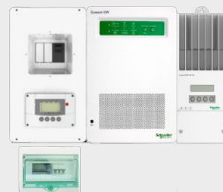
Configuration with SW PDP for 230 VAC