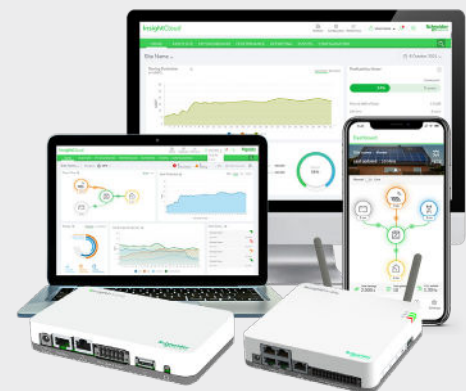
Insight Energy Management