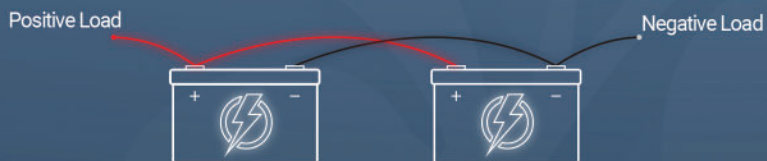
Parallel Connection 12V 100Ah Bank Increases Ah, Voltage stays the same.

The heater will activate when the internal temperature for the battery reaches 35°F. If the battery has been exposed to below freezing temperatures for a long time without the heater enabled, it will take 2 to 4 hours for the internals of the battery to heat up enough for the battery to take a charge.