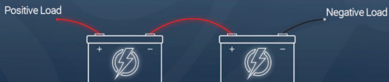
Series Connection 48V 100Ah Bank Increases Voltage, Ah stays the same.