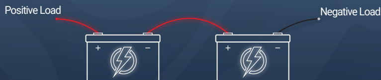
Series Connection 24V 75Ah Bank Increases Voltage, Ah stays the same.