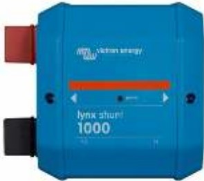
Lynx Shunt VE.Can