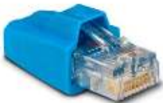
RJ45 VE.Can terminator