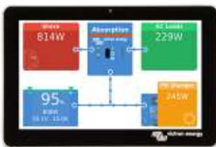
GX Touch (optional display for Cerbo GX)