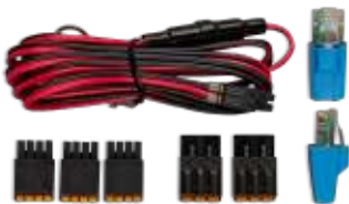
Accessories included with the Cerbo GX

The Cerbo GX is easily mountable and can also be mounted on a DIN-Rail using the DIN35 adapter small, (not included). Its separate touchscreen can be bolted on a dashboard, eliminating the need to create perfect cut-outs (like with the Color Control GX). Connection is easy via just one cable, taking away the hassle of having to bring many wires to the dashboard. The Bluetooth feature enables a quick connection and configuration via our VictronConnect app.