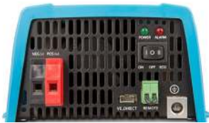
Phoenix 12/375 VE.Direct