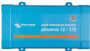
Phoenix 12/375 VE.Direct