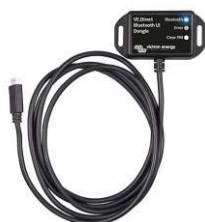
VE.Direct Bluetooth Smart dongle (must be ordered separately)

An excessively high or low battery voltage is indicated by an audible and visual alarm, and a relay for remote signalling.