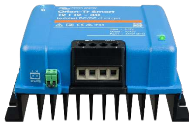
Orion-Tr Smart 12/12-30