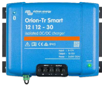
Orion-Tr Smart 12/12-30