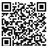
Battery Line QR Code

To use the QR code, open the QR reader or camera on your smart phone. Hold your device over the QR code so that the code is clearly visible within the device's screen. Your phone will automatically scan the code and pull in the corresponding weblink.